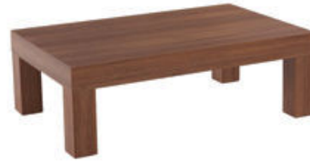
Rectangular Coffee Table OHF-01