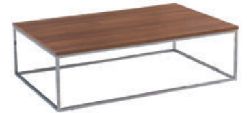
Rectangular Coffee Table OHF-02