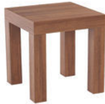
Side Table OHF-01