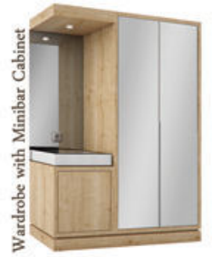
Wardrobe with Minibar Cabinet