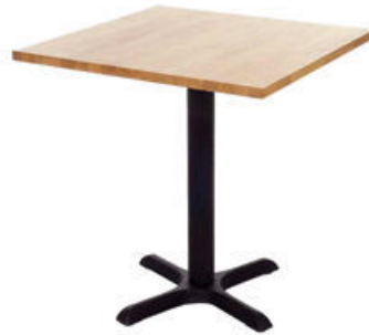
Square Table OHF-02