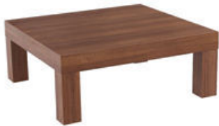
Square Coffee Table OHF-01