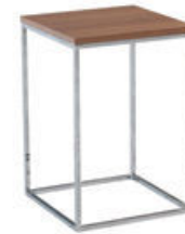
Side Table OHF-02