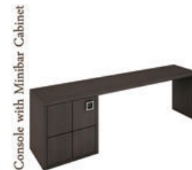
Console with Minibar Cabinet