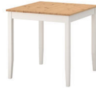
Square Table OHF-03