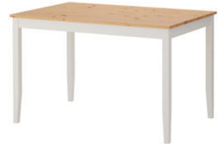
Rectangular Table OHF-01