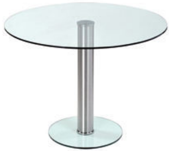
Circular Table OHF-01