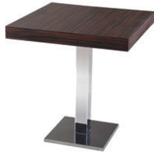
Square Table OHF-01